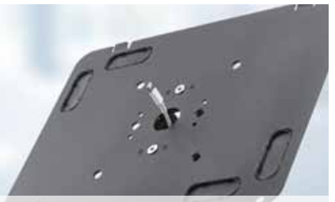
The TabletSafe or connect plate is securely attached to the connect joint. Perfect cable management hides cables from view. With internal cable routing, the tablet / device can be turned +/- 45 degrees in each direction.