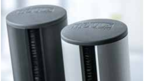
High-quality silver- or black anodised aluminium profiles. Cables are routed through the inside of the column where they are concealed by practical brush seals.