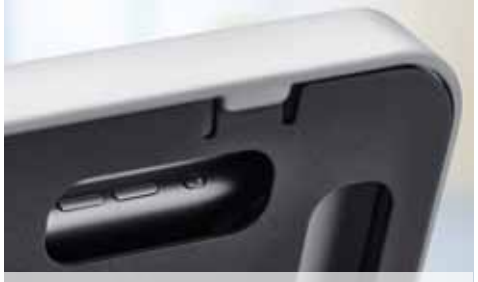
Control functions remain accessible by the practical apertures. If not used, they can be closed off with cover caps.