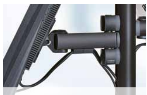
Practical cable holders provide secure, neatly organised cable management on the arm.