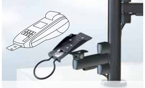
Customised mounting options for attaching brand-specific peripheral devices.