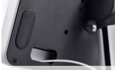
Alternatively the connect joint enables a turning of 360 degrees.