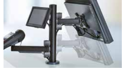
Infinitely variable in height, the arms let you position terminals, keyboards and monitors wherever you choose.