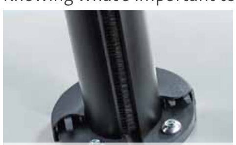
2-in-1: Screw-on and screw-through attachment for using existing means of attachment.